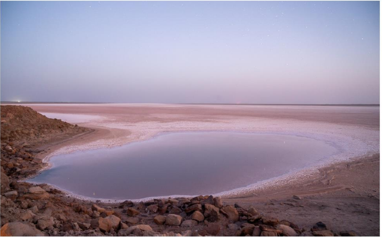
Dholavira Salt pans