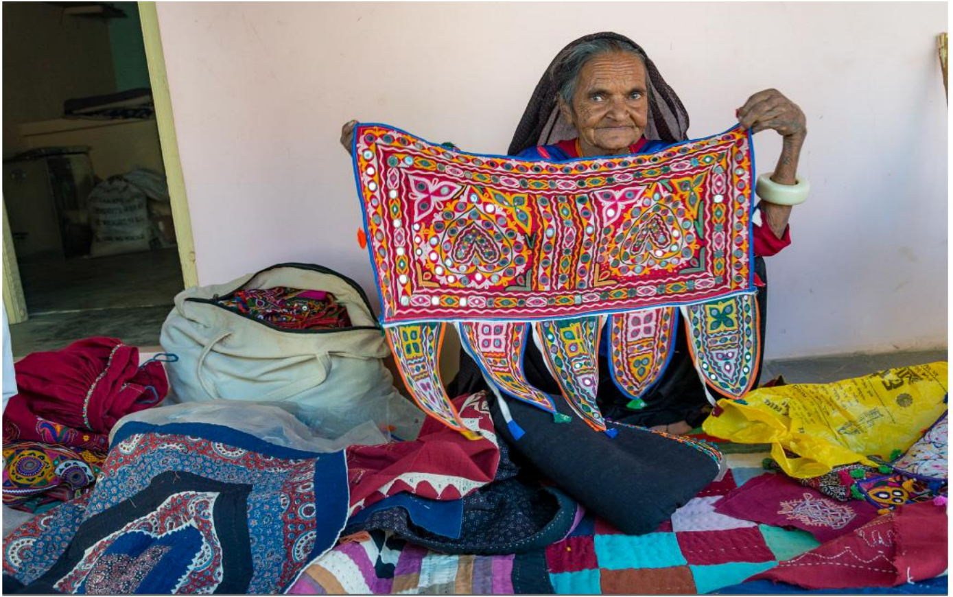
Sumarsarsekh Village - Old lady with her handicraft