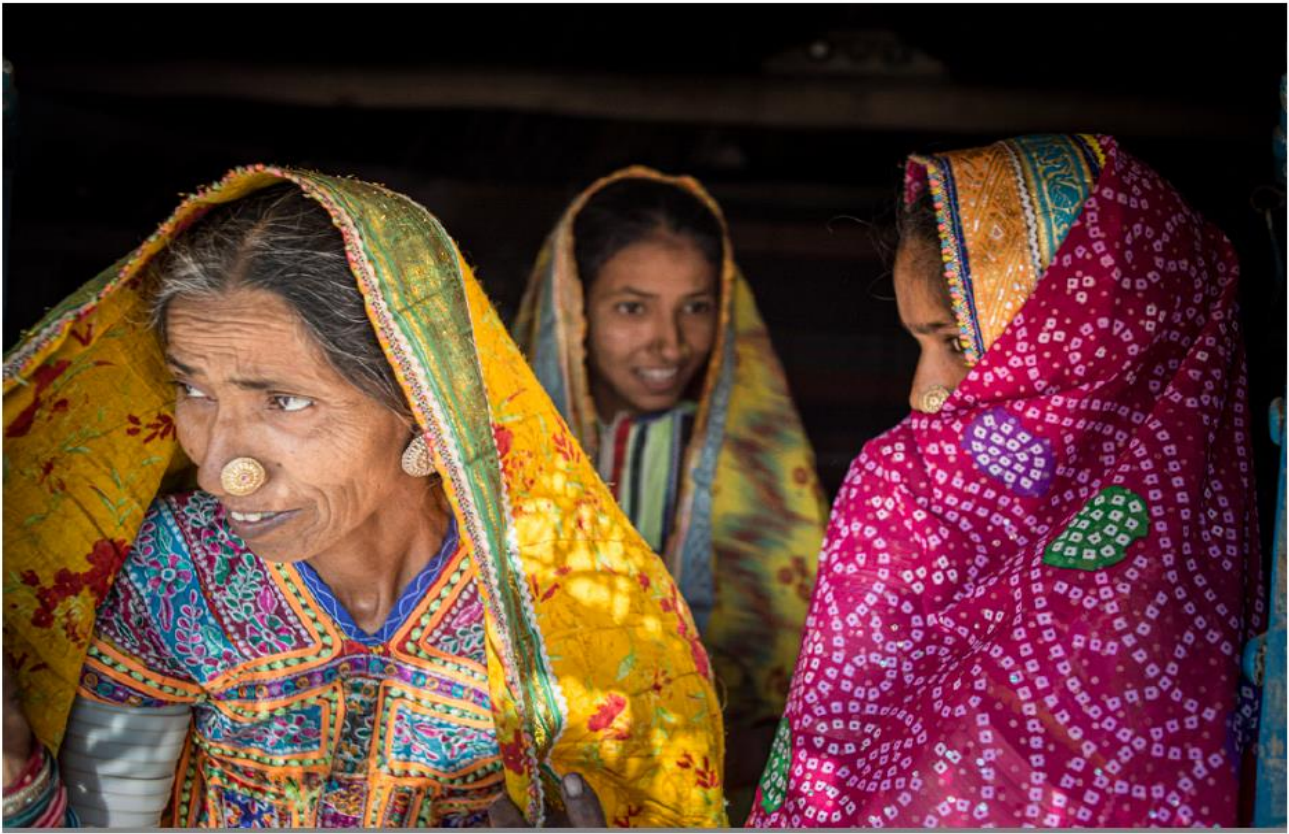
Women in their traditional attire