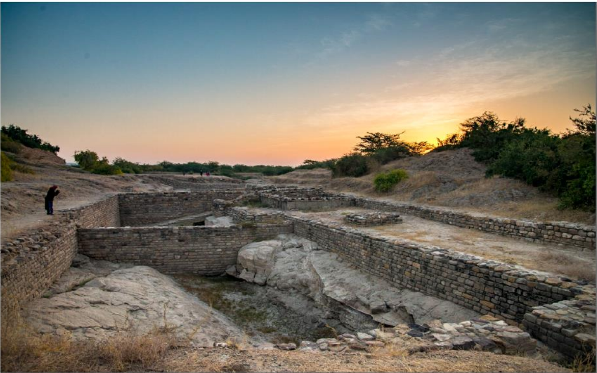
Dholavira Archaeological Site