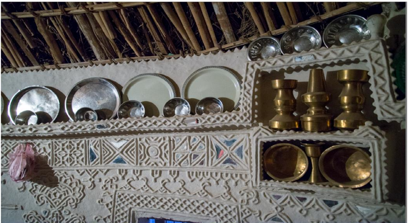
Lippan Art in Village huts