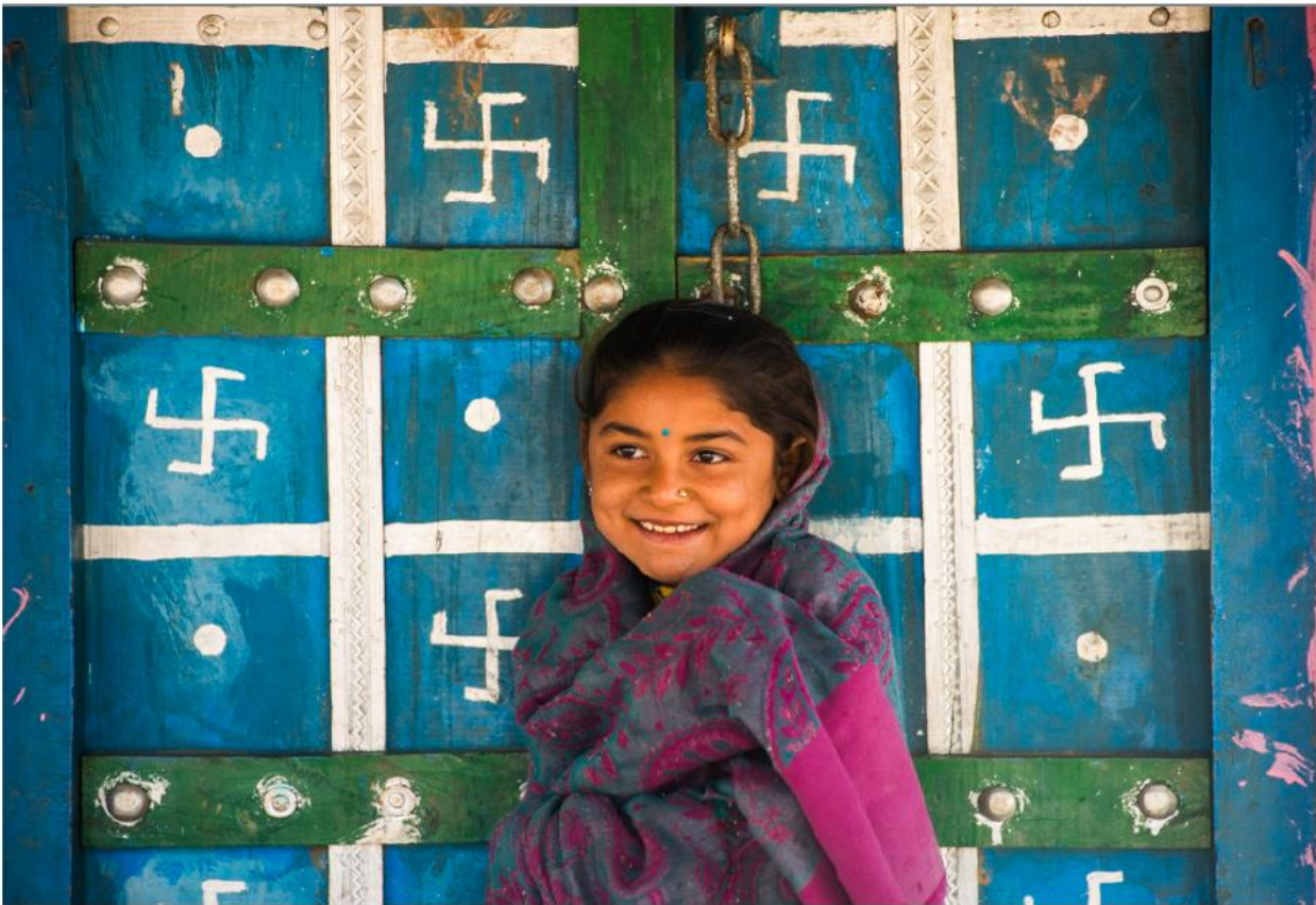
A young girl in the village