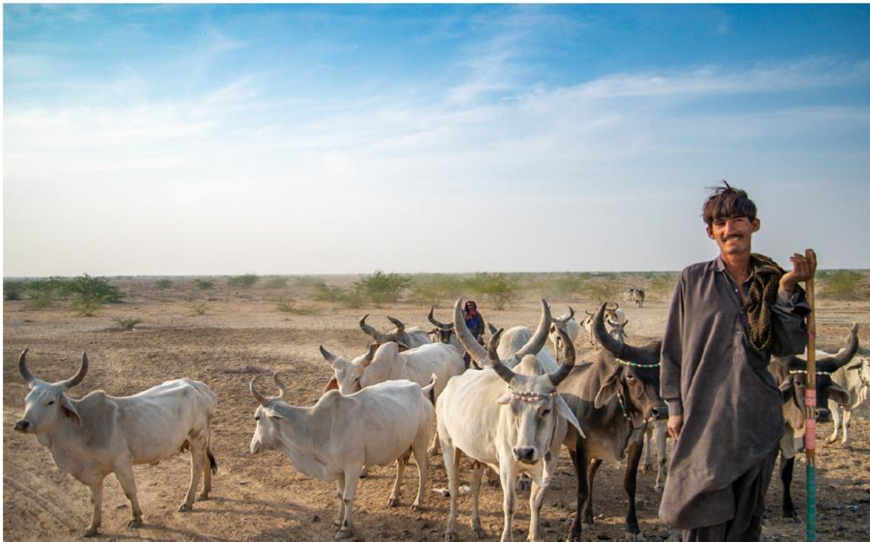
Cattle herders on the way to Rann