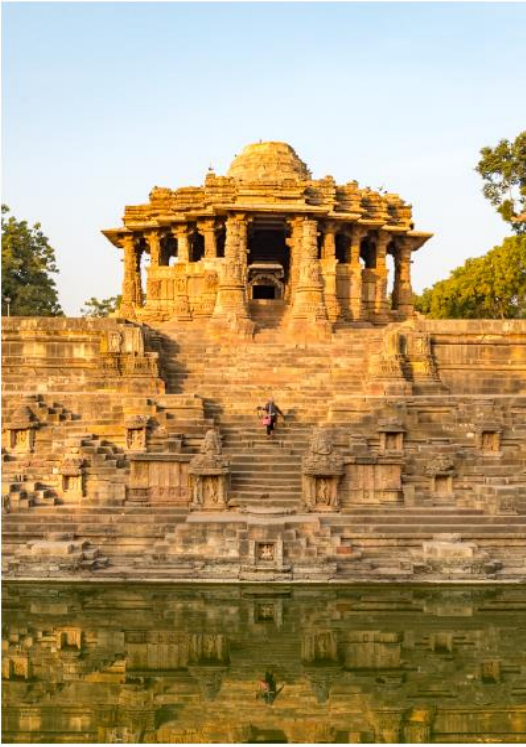
Sun Temple (Surya Mandir) Modhera