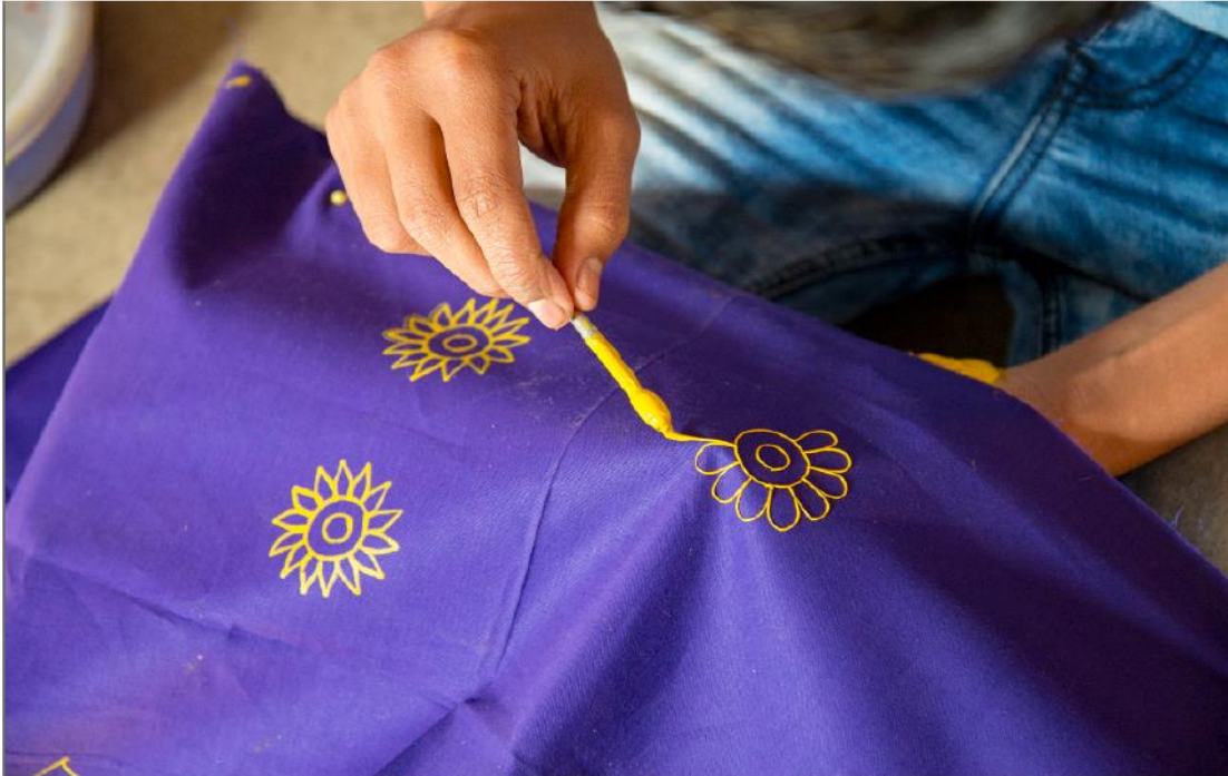
Rogan Art on Textiles

What to Expect: Day 2 delves deep into the cultural fabric of Gujarat. Immerse yourself in the lives of ethnic minority communities residing in the region. Experience their way of life, interact with locals, and witness age-old traditions passed down through generations. Later, visit traditional textile factories to witness the intricate processes of dyeing and weaving that contribute to the vibrant heritage of the area.