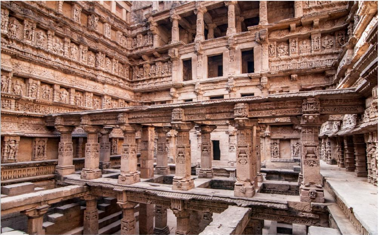
Rani Ni Vav